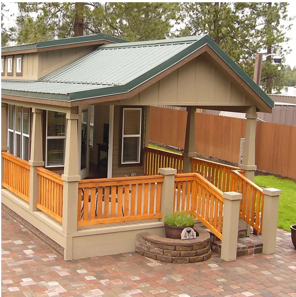
New Senior Apartments Coming to Mankato (Take A Look at The Prices)